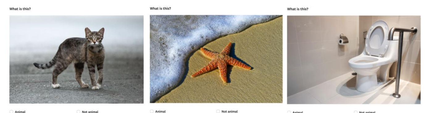
Figure 1. Examples from English version task, with archetype animal (left), non-archetype animal (centre) and non-animal (right)

different children speaking different languages, and comparisons within children where they principally spoke a language different from language of instruction. Second, how does children's monolingual and multilingual understanding of "animal" develop with age? To address this question, the study also compared task performance across three different age groups.